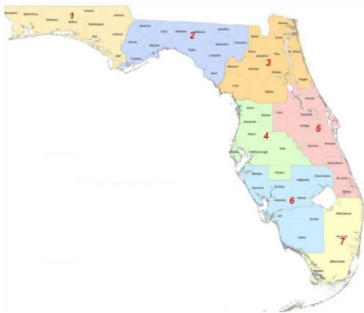
Committee Region Map